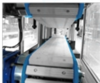
Profile Caterpillar Haul-off 履帶式引取機