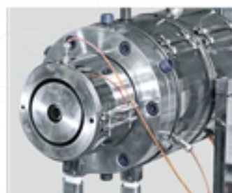
Die Head 押出模頭