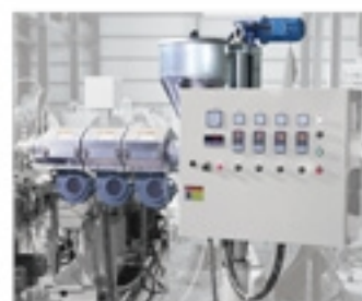
Single Screw Extruder (Sub-extruder) 副料押出機