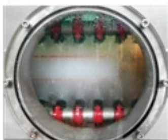
Vacuum Spray Water Cooling Tank 真空噴霧水槽