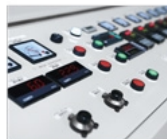
Operation Control System 操作控制系統