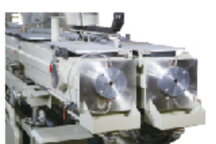
Vacuum Spray Cooling Tank 真空噴霧冷卻水槽