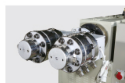
Dual Line Die Head 雙管押出模頭