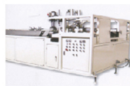
Automatic Belling Machine 自動放口機

* Specifications and standard equipment are subject to change without notification. Depending on product, material and demanded output. * 規格及設備內容會變遷，恕不另行通知。根據產品、物料和要求的押出量而定。