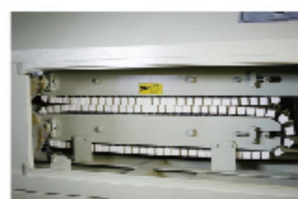
Haul-off Machine 引取機