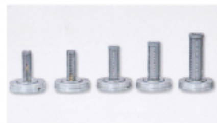
Vacuum Sizing Sleeve / 成型模

振法機械廠股份有限公司自創立以來，即從事PVC雙螺桿押出機之研發設計製造，至今已有多年的豐富經驗。我們擁有專業的機械工程師、經驗豐富的配方及操作技術人才，能滿足客戶多方面的需求。PVC雙管製管生產設備是振法公司所專業製造的優良機種之一。