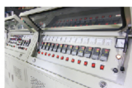
Operation Control System - Tradition operation-control type - PC Base machine operation