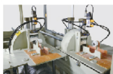
Non-Dust Cutting Machine 無屑鋸斷機